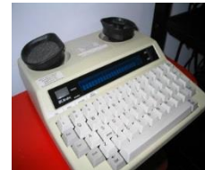
Telecommunication Device for the Deaf (TDD/TTY)

If hearing or speech problems make it difficult for you to access the telephone, the Oklahoma Equipment Distribution Program may be able to assist you. The Oklahoma Equipment Distribution Program strives to make communication accessible to Oklahomans of all ages through various programs. Qualifying individuals may receive services and equipment at little or no cost.