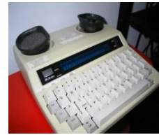
Telecommunication Device for the Deaf(TDD/TTY)

If hearing or speech problems make it difficult for you to access the telephone, the Oklahoma Equipment Distribution Program may be able to assist you. The Oklahoma Equipment Distribution Program strives to make communication accessible to Oklahomans of all ages through various programs. Qualifying individuals may receive services and equipment at little or no cost.