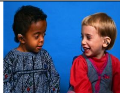
Children's Hearing Aid Program